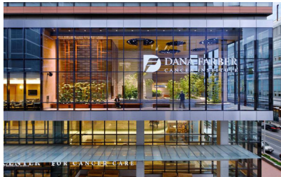
Dana-Farber Cancer Institute Boston, Massachusetts