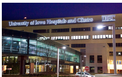
University of Iowa Hospitals & Clinics Iowa City, Iowa