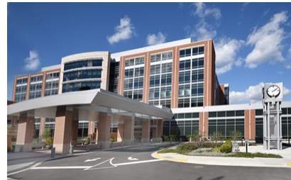
John Hopkins Medicine - Sibley Memorial Hospital Washington, DC