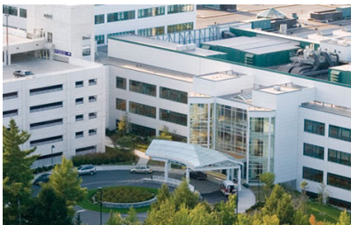
Dartmouth-Hitchcock Medical Center Lebanon, New Hampshire