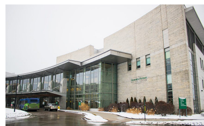
University of Vermont Medical Center Burlington and Colchester, Vermont