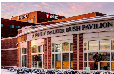
Southern Maine Medical Center Biddeford, Maine