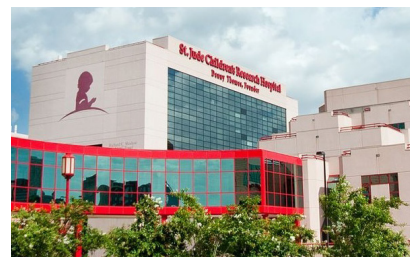
St. Jude Children's Research Hospital Memphis, Tennessee