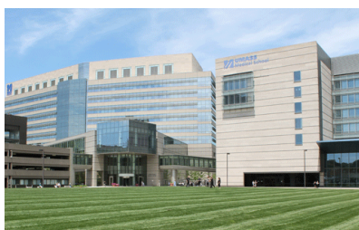
University of Massachusetts Medical School Worcester, Massachusetts