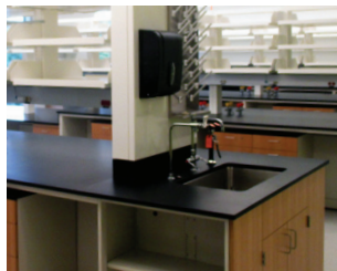
Dartmouth-Hitchcock W.T. Research New Lab & Vivarium Bldg.