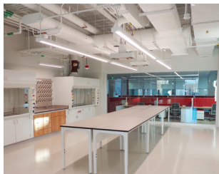
Ariad 125 Binney St., New Lab & Vivarium Bldg. Fit Out