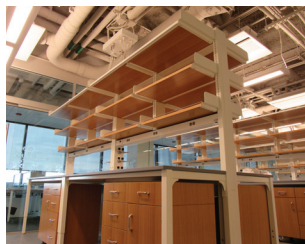
Tufts Science & Engineering, New Bldg. w/ Lab & Classrooms