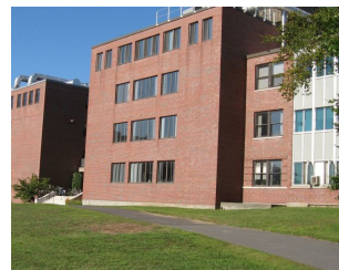
UMass Amherst Morrill 1, ABSL-3 Bldg. Renovation & APVs