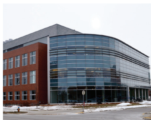
Iowa State University, Commissioning Agent of Record Since 2007