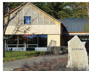
Alnoba Leadership Training Center, 1st Passive House Building in New England