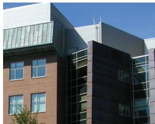
Dartmouth, Class of '78 Life Science New Lab Bldg. LEED Platinum