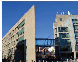
MIT Bldg. 66, Lab Bldg. Renovation