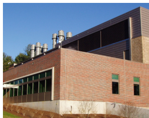
Tufts New England Reg. Biosafety New Lab Bldg. & APVs