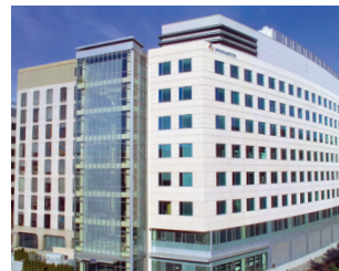
Novartis 100 Tech Sq., Lab & Vivarium Controls Upgrade