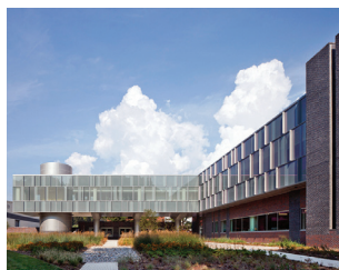
Jefferson Laboratories, Tech. Engineering & Development Facility Renovation & Expansion