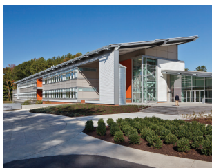
Smithsonian Environ. Research Ctr., Mathias Lab Renovation & Expansion, LEED Platinum