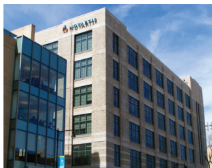
Novartis 250 Mass. Ave., Vivarium & Mechanical Infrastructure Retro-Cx