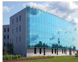
Service Credit Union, New Office Bldg. LEED Gold