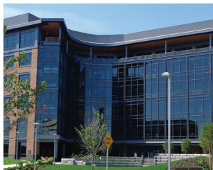
Trip Advisor, World Headquarters Core & Shell LEED Gold